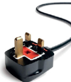
UK TYPE PLUG