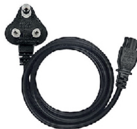
INDIAN TYPE PLUG