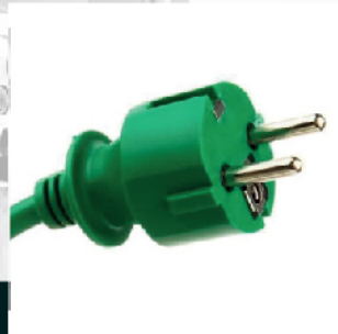
SCHUKO TYPE PLUG