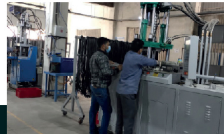
Imported Injection Molding