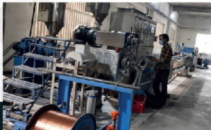
High Capacity Extruder Line

Our world-class infrastructure is secured, reliable and scalable enough to take Manufacturing to the next level. We maintain our infrastructure agile, enabled with facility of latest machines and technology.